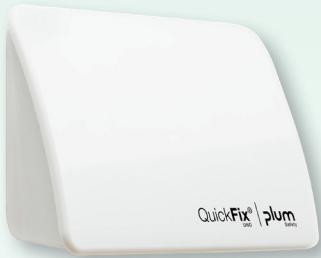
Plum QuickFix Uno, white

A Plum QuickFix plaster dispenser provides a structured approach to first aid of minor injuries. It is a flexible system for workplaces that are not challenged with dust and dirt. Both the Plum QuickFix Uno and Plum QuickFix SOLO® are small dispensers that combine workplace safety with modern style.