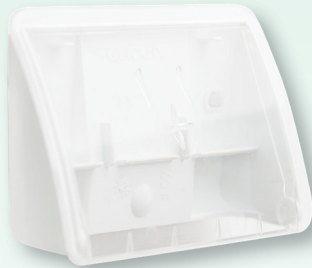
Plum QuickFix Uno, transparent