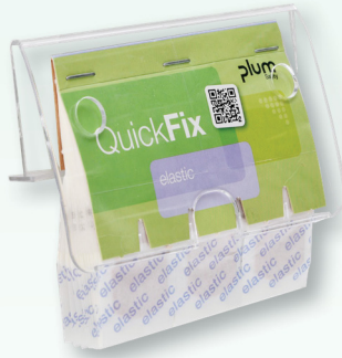
Plum QuickFix SOLO®, transparent - shown with example of plaster refill