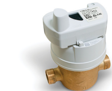
Aquadis+ equipped with the Cyble 5A module