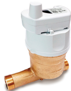
TD8 equipped with the Cyble 5A module