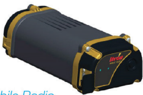
Itron Mobile Radio (actual size: 3.20" W x 5.66" L x 1.53" H)