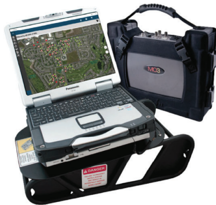
Itron MC3 Radio (actual size: 13" W x 11.25" L x 2.75" H)